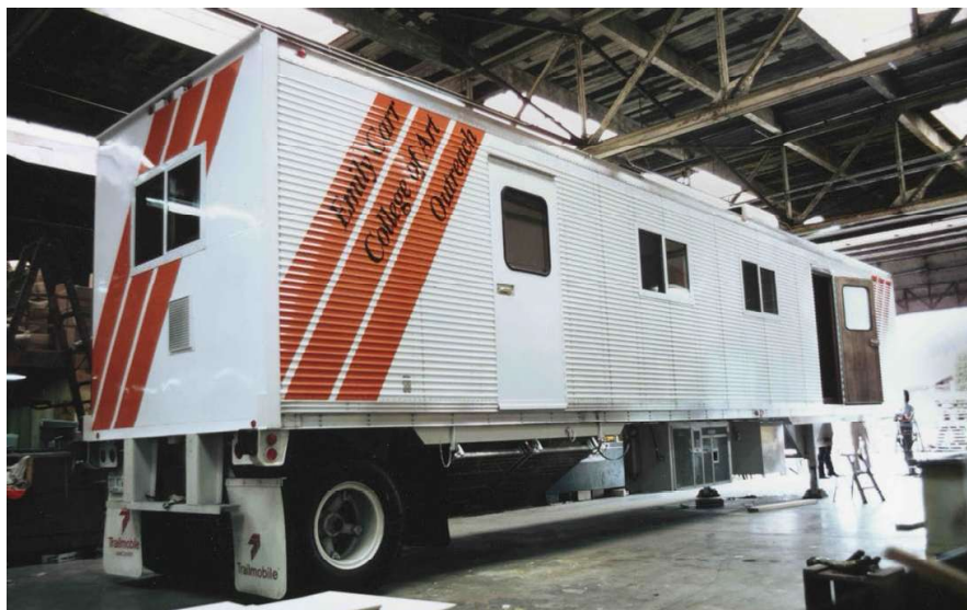
Printmobile, ECCAD Outreach program, 1979.

On view at the Libby Leshgold Gallery in support of ECU 100 th anniversary, En Route: mobile forms of art and education highlights historical and contemporary source materials, media and artworks from 1979–1985, and explores the importance of artist-led classrooms and informal learning environments and the impacts and legacies they have had across communities. For example, the travelling Printmobile brought art education to communities across British Columbia. In operation for seven years, this program was a traveling service aimed at expanding creative learning beyond the traditional classroom. Other projects presented include distance-learning telecourses and a touring BC Young Artists Biennial.